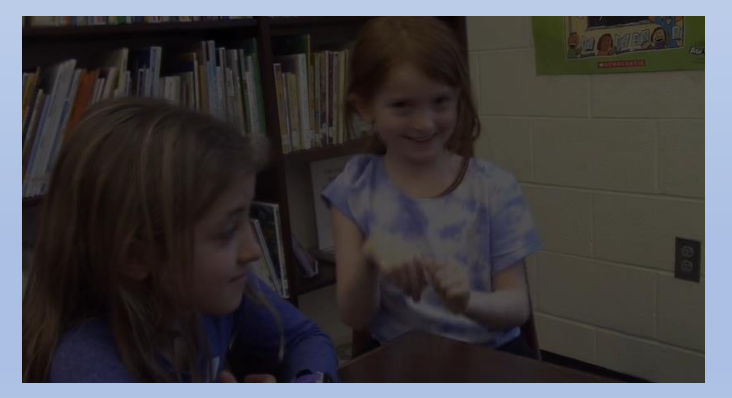
The transitions between scenes 2 – 7 fade to black since the scenes are short and physically close