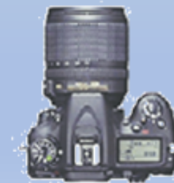
Mid Shot on Both